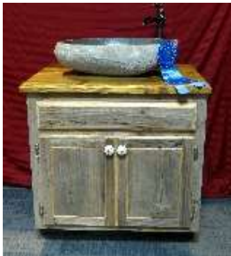
Best of Show 2017

Alabama Woodworkers Guild 10544 Highway 17 Maylene, AL 35114