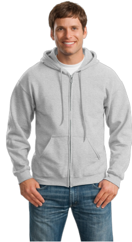
Gildan® - Heavy Blend™ Full-Zip Hooded Sweatshirt. 18600