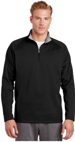
Sport-Tek® Sport-Wick® Fleece 1/4-Zip Pullover. F243

Our Sport-Wick technology transforms anti-static fleece into an excellent warm up and cool down option. Your top layer releases moisture from inner layers, while keeping your skin comfortably dry.