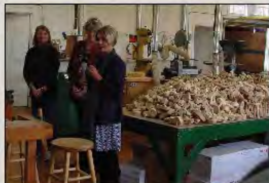
Children’s Hospital Staff accepting the toy donation from the Alabama Woodworkers Guild.