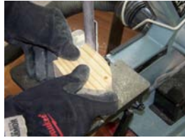
Sand it a little.