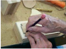
Now, draw an outline on a piece of wood.

It's easy...let me show you how. First go to the Alabama Woodworkers Guild web site and download some plans. Here, let me help you...click on this: http://www.alabamawoodworkersguild.org/toy%20plans/Toy%20Plans.pdf