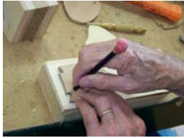
Now, draw an outline on a piece of wood.

It's easy...let me show you how. First go to the Alabama Woodworkers Guild web site and download some plans. Here, let me help you...click on this: http://www.alabamawoodworkersguild.org/toy%20plans/Toy%20Plans.pdf