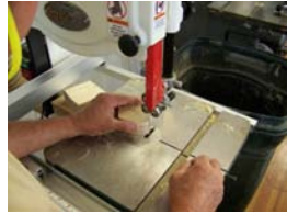
Next, cut it out with the band saw.