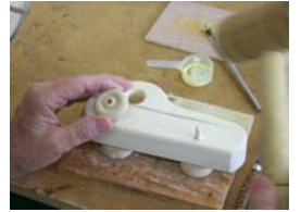
Attach the wheels and axles.

Now, you are pretty much done.... EXCEPT , now you can make a few more while you're at it for donation to deserving children at Children's Hospital or another fine charity!