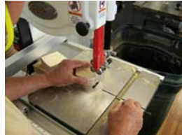
Next, cut it out with the band saw.