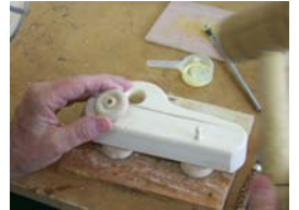
Attach the wheels and axles.

Now, you are pretty much done.... EXCEPT , now you can make a few more while you're at it for donation to deserving children at Children's Hospital or another fine charity!