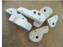
If you're making cars, bore holes for the axles and windows.