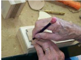
Now, draw an outline on a piece of wood.

It's easy...let me show you how. First go to the Alabama Woodworkers Guild web site and download some plans. Here, let me help you...click on this: http://www.alabamawoodworkersguild.org/toy%20plans/Toy%20Plans.pdf