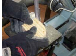
Sand it a little.