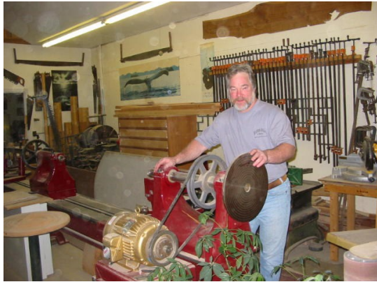
Blackwood Gallery & Studio, Springville, AL

Driving directions: I-59 N to Hwy. 174 (exit 154). Go left on Hwy 174 to 4-way stop. Turn left onto Hwy. 11. Gallery and shop is ½ mile on right. Phone: 205-467-7197