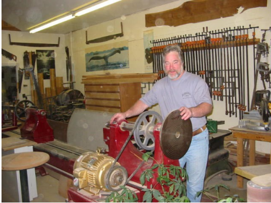
Blackwood Gallery & Studio, Springville, AL

Driving directions: I-59 N to Hwy. 174 (exit 154). Go left on Hwy 174 to 4-way stop. Turn left onto Hwy. 11. Gallery and shop is ½ mile on right. Phone: 205-467-7197