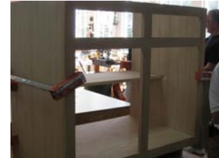
Cabinets under construction for Habitat For Humanity