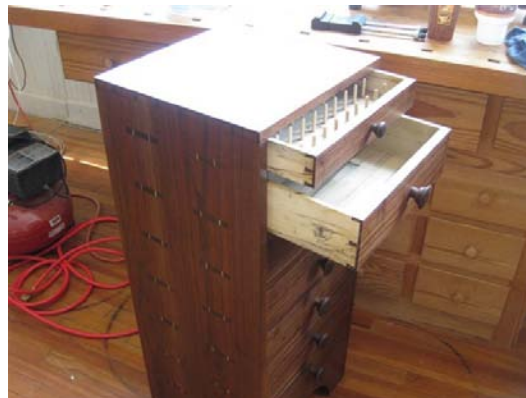
Walnut and spalted poplar sewing cabinet by Eddie Heerten