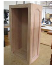
Brian Stauss' kitchen cabinet