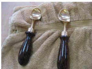
Ice cream scoops by Dwight Hostetter