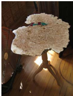
Mike Key's 3 legged table