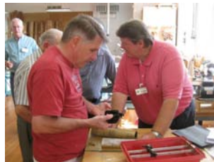
Pre-meeting sharpening demonstration