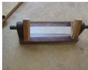
Dwight Hostetter's Prism