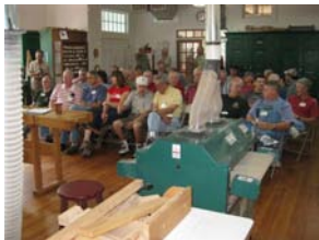
Nice meeting turnout!