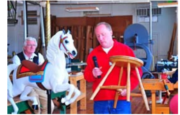
Wonderful four-legged stool by Pat Weisend .