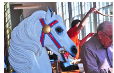
Close-up of horse created by Ira Chafin