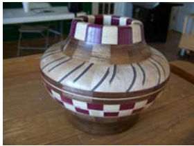
Amazing segmented bowl by Nevin Newton