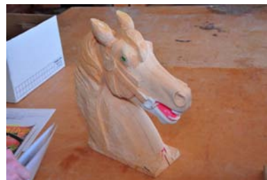
Head of Carousel horse at an intermediate stage of creation