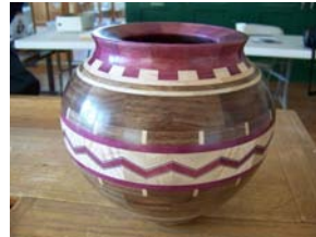
Close-up of Nevin's bowl