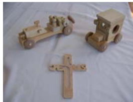
Wooden Toys and Cross by Buddy Finch