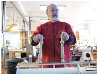
Spindles by Colson