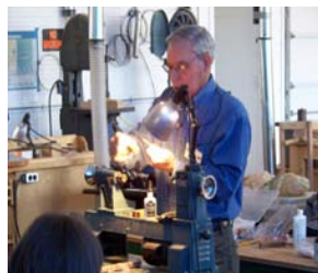
Assembling the Pen