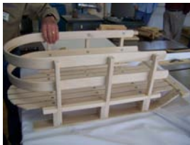
Snow Sled by Raymond Maples