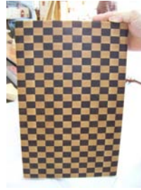
Cutting Board by Preston Lawley