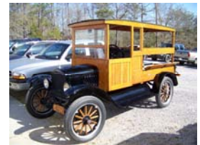
Wilbur Holaday's Truck