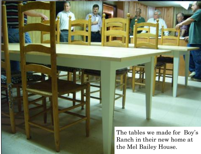
The tables we made for Boy's Ranch in their new home at the Mel Bailey House.