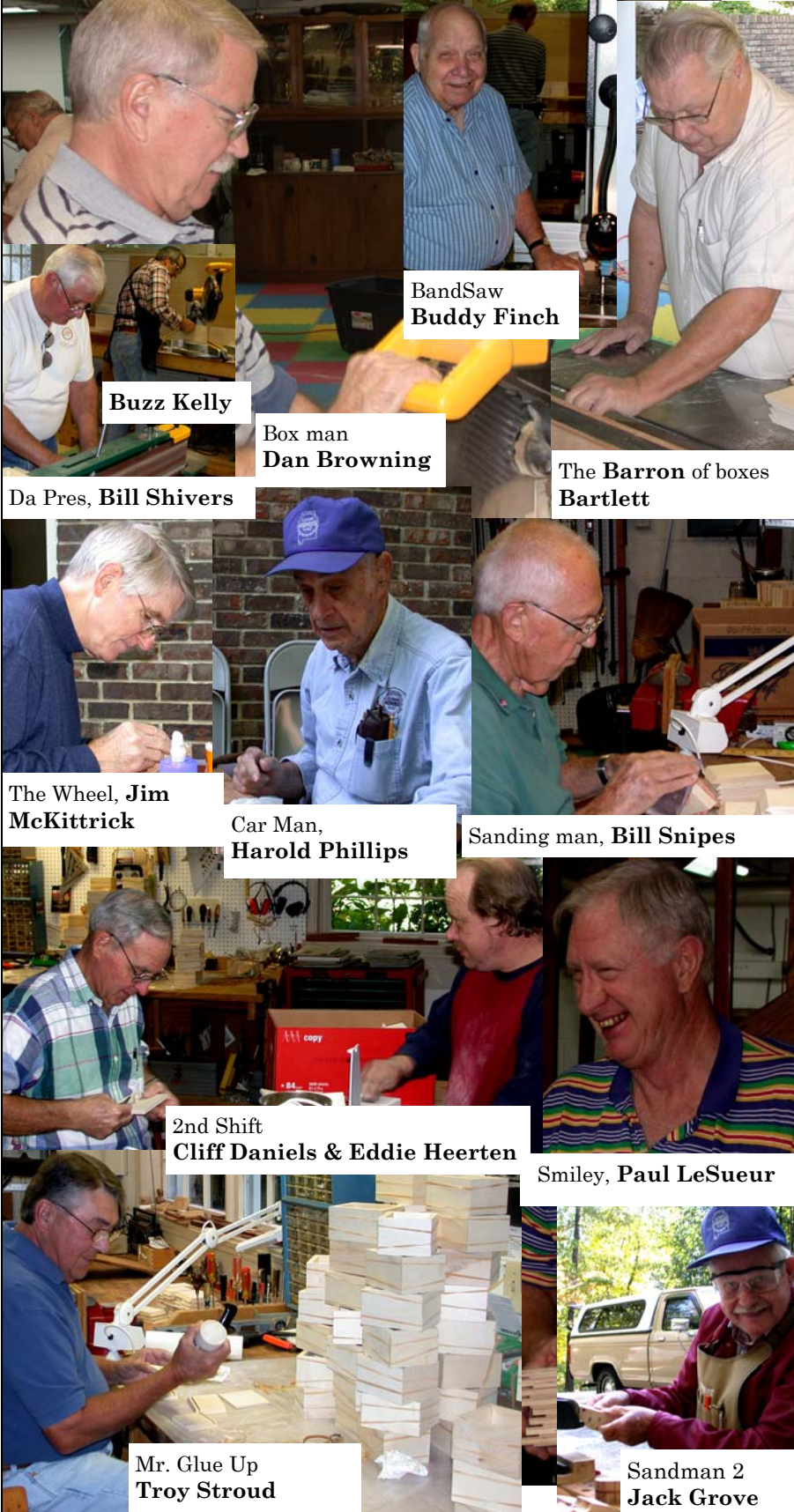
BandSaw Buddy Finch

These guys (and one female) turned out 250 cars and boxes !!!!